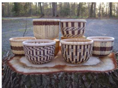
The newest baskets in the design workshop

If you choose a bowl with lid, consider having your knob scrimmed. Contact us to discuss this so your knob is ordered early and arrives in time for the Retreat.