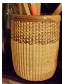
Jude's Utensil 8" Jude's Utensil $99