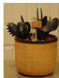
Large Utensil 10" Large Utensil $149

The Antique Tray Set The antique tray set consists of three beautiful round moulds; they are 10', 12", and 14 inches in diameter. The one shown at the left is the 12" round tray made on the 12" antique mould. Make one or the set! They are made of hardwood for the base and rims and cane for the stakes and weavers. 1- 3 day project