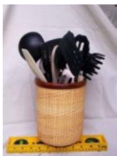
Small Utensil 6" Small Utensil $77

The Utensil Nantucket is one of the easiest and most useful Nantucket's to have and make. They come in 3 sizes: 6", 8" and 10" and are made with hardwood and cane. To weave the 10" please call Denise. 1- 3 day project